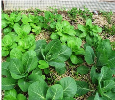
Bok Choi, Cabbage, Sweet Peas