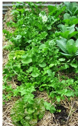
Lettuce, Rocket, Capsicum, Cabbage