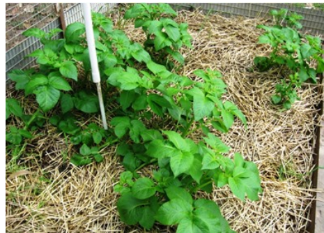
Spuds through at last!