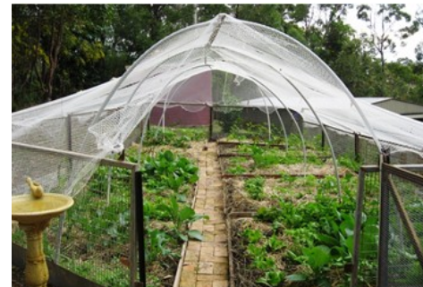
The Bride Garden

Here's some shots from the garden today (7 th July)